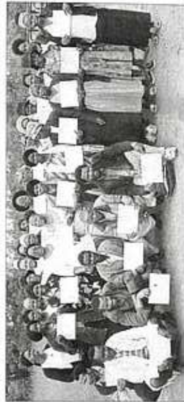
The first group of 32 volunteers who worked with the Swaziland Reformed Church.

into a small army of volunteers who want to serve God and their neighbours in a new way, not with the expectation of being rewarded for what they are doing, but doing it because they believe that this is what Jesus would have done if He had still been living on earth as a person today," he said. On the question of how serious