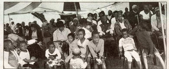
TAKEN CARE OF: These are some of the children to be fed in the soup kitchen.

The NCP at Mbangweni caters for 124 children who will get a meal daily.