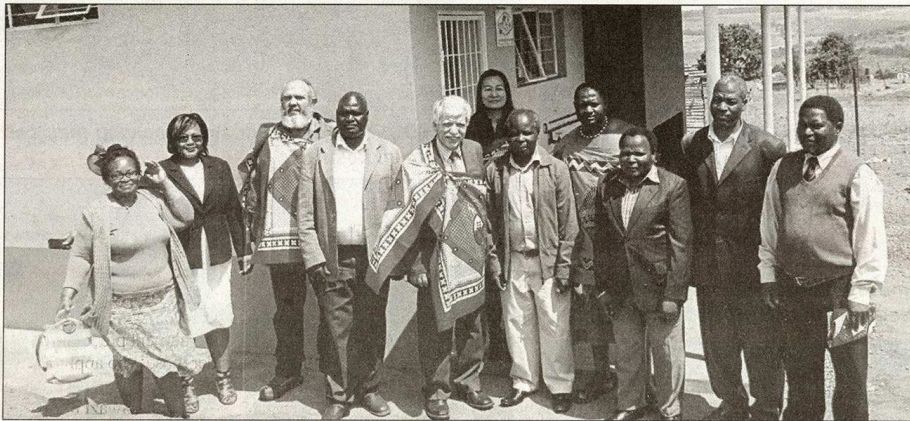
GOOD GESTURE: Dignitaries including the leadership of Mbangweni Umphakatsi in a group photo after the official opening of the soup kitchen.